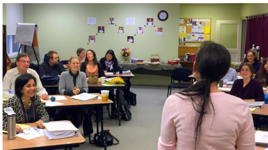
Fall 2016 Professional Mediation Training Cohort

Building critical skills to communicate effectively reduce conflict, and resolve conflict peacefully.